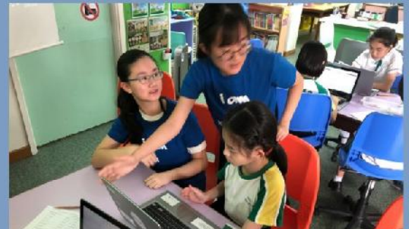
The student tutors are teaching our students patiently.