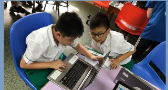
They are learning to use a new computer programme.

Students learnt different coding skills in the workshop. They made stories and mini games with different codes. They enjoyed sharing their works at the end of each session. Everyone was satisfied with his or her work and grateful to the student tutors.