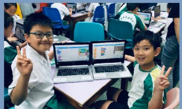
Look! Students are satisfied with their design.