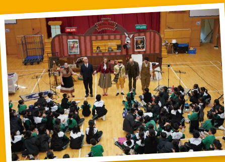
It is more like a workshop which involves the participation of the audience.