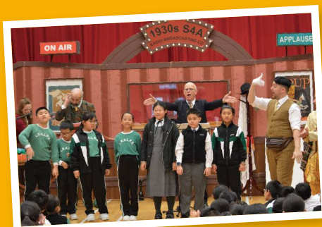
The students are very eager to participate in the workshop and have a great time!