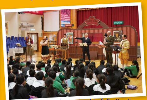
Everyone is paying his full attention to the actors and actresses.