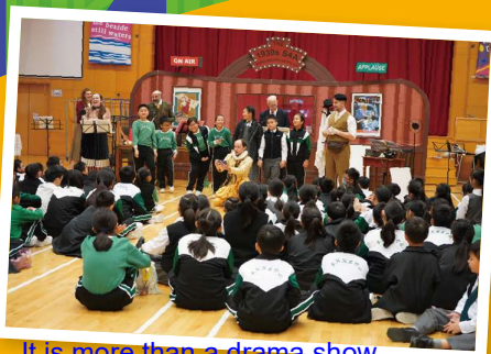
It is more than a drama show.

In the one-hour drama pre-show workshop, there were different stations where students could know more about props, sound effects, scripts, Shakespeare, and the history of radio in a fun and interactive way. The team of S4A retold one of the famous plays of William Shakespeare – A Midsummer Night's Dream, in an interesting and creative way. During the one-hour drama performance, students tried out some drama techniques that they had just learnt in the pre-show workshop. Some students even took on roles in the show. It is definitely a fun way for students to learn more about English literature which may sound boring and difficult to students!